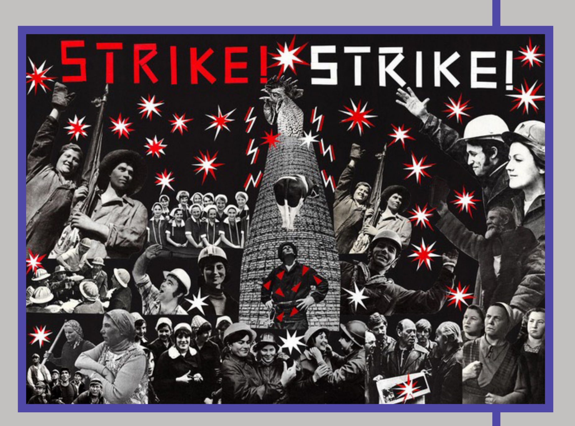
Masha Svyatogor, Strike! Strike!, 2020