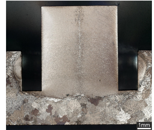
Macrograph of representative CFP rod